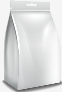
Off-Centre Seal Packaging Pouches