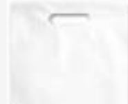
D Punch Handle