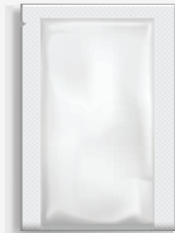
Three Side Seal Packaging Pouches