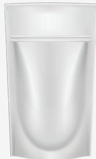
Stand Up Packaging Pouches