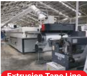
Extrusion Tape Line (Lohia Make)

Our latest and technically advanced manufacturing unit is well equipped with all kinds of up-to-date machinery and instrument to cater the needs of the clients.