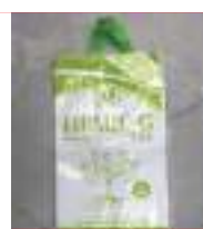
PP Handle Bags