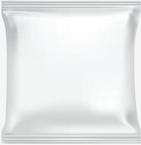
Centre Seal Packaging Pouches