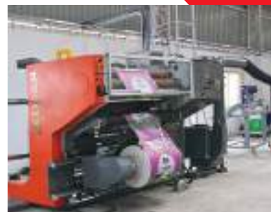
Cantilever slitter machine (Pelican Make)