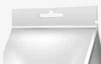
Euro Punch Handle