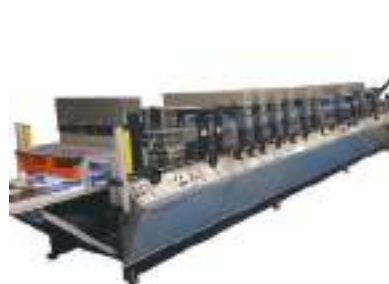
Stand up pouching machine