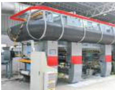
Printing machine (Pelican Make)