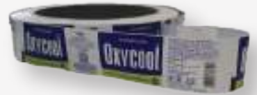
Printed Laminated Rolls