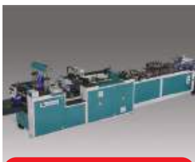
Center seal machine