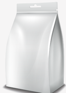
Five Side Seal Packaging Pouches