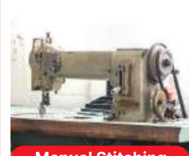
Manual Stitching Machine Qty 15