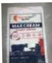
PP Flexo Printed Bags