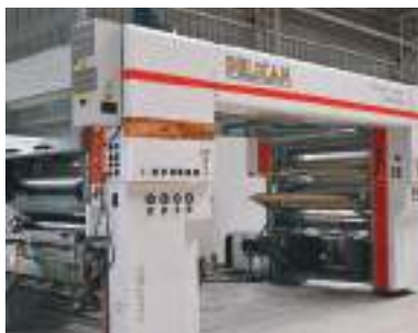
Solventless lamination machine (Pelican Make)