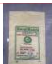
PP With Liner Bags