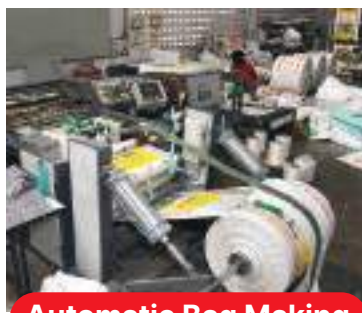
Automatic Bag Making Machine (No. 4)