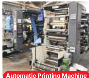
Automatic Printing Machine (6 color 3Qty & 8 Color 1 Qty)